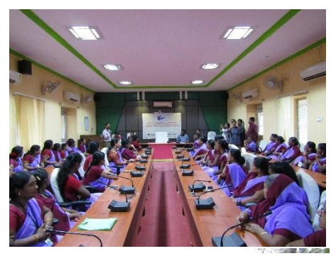
Figure 1: Orientation for SHG on referral initiative

Step 2: The second step was to build a consensus between SHG and cesspool operator for sharing the referral fee. For this, a discussion was organized